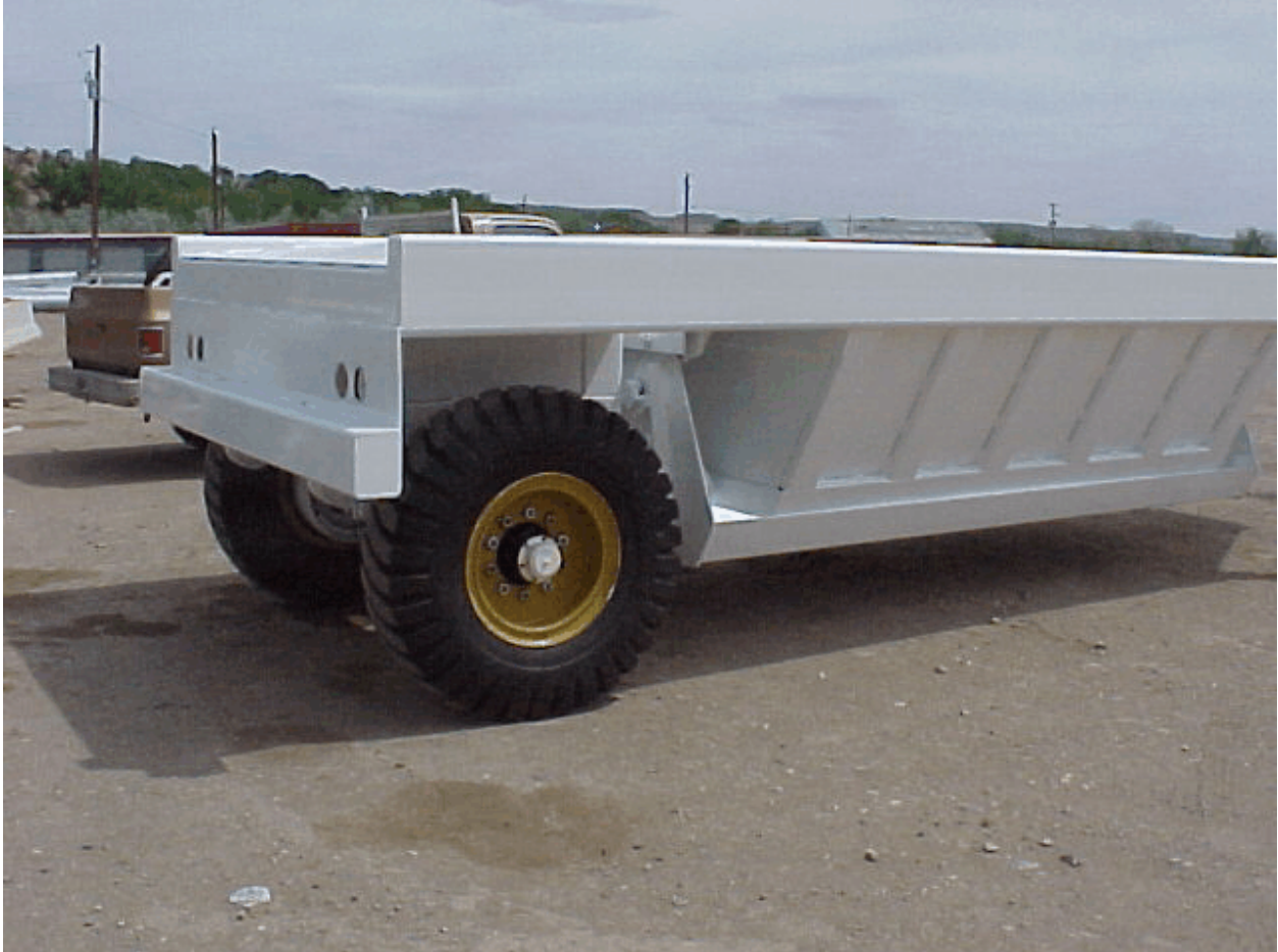
UNDERGROUND BELLY DUMP GRAVEL TRAILER.