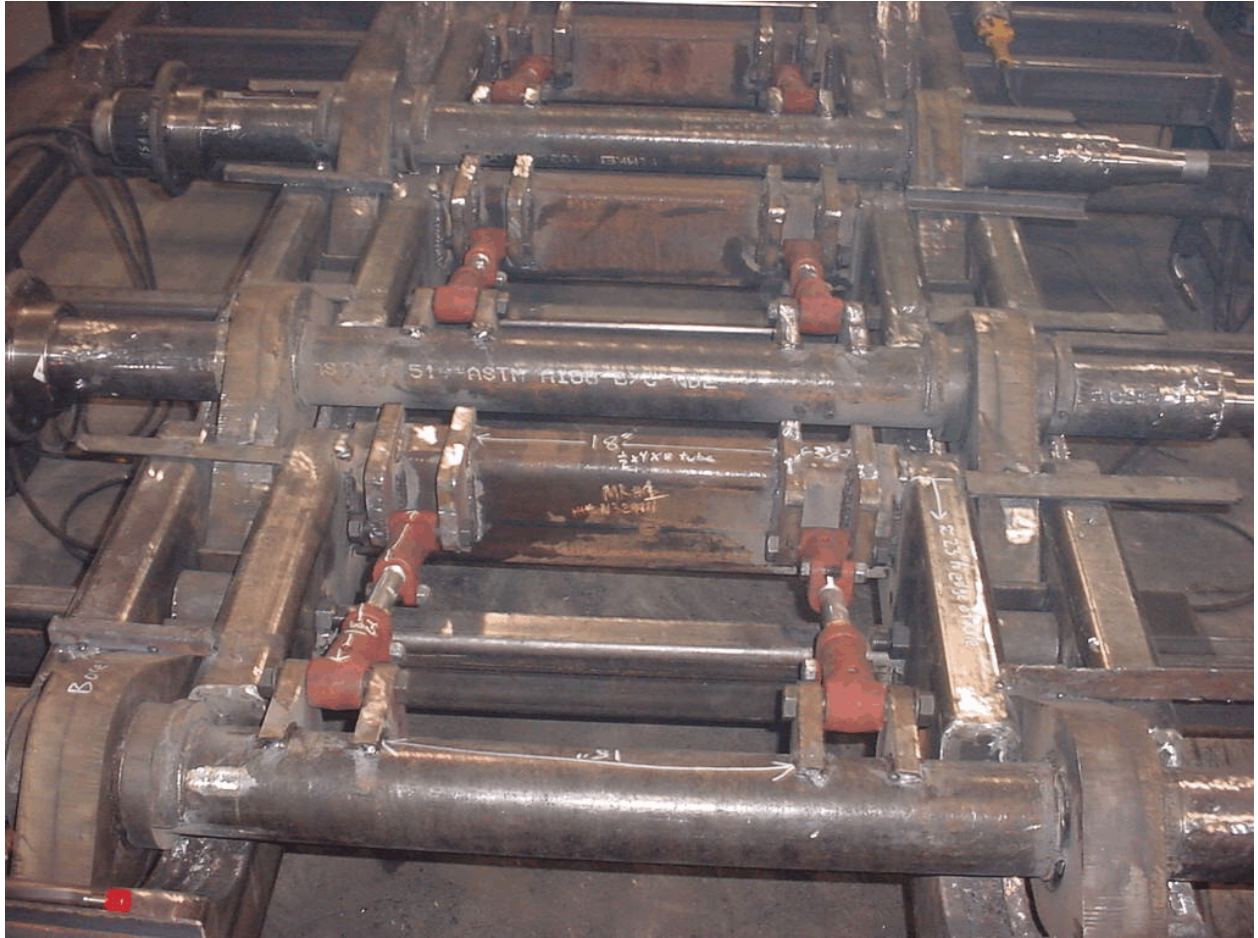
Construction of 3-axle floating suspension. Rocker arms, axle arms, drag links, and axles are shown here.