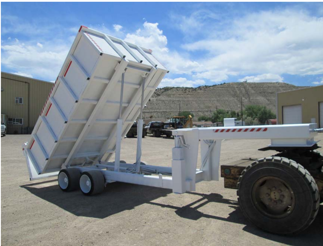
With the bed raised, showing the cylinders and frame