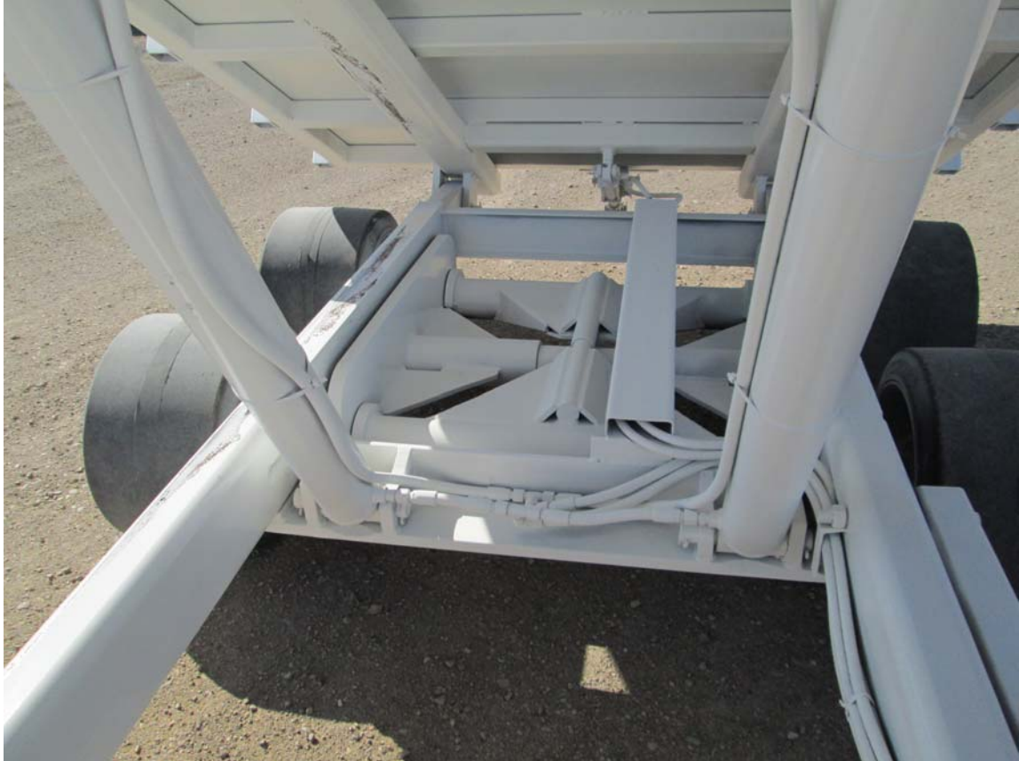
Details of under carriage and lift cylinders