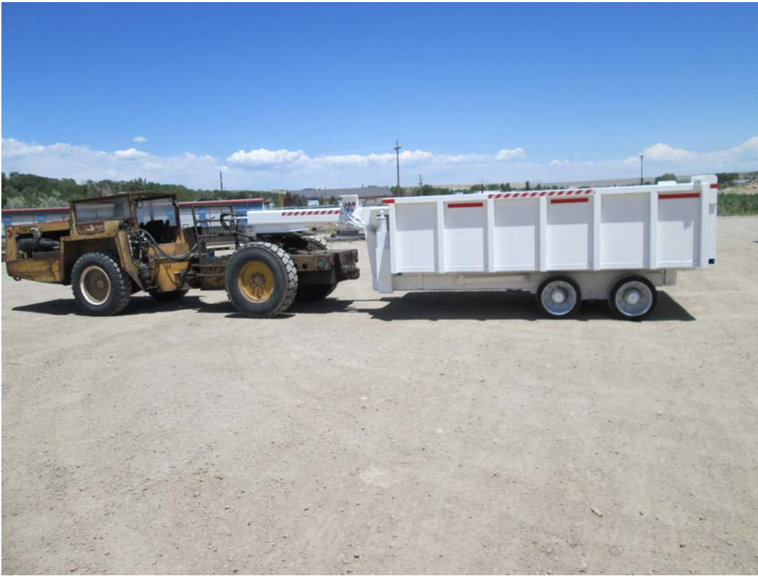
Dump Bed Trailer in Transport Position